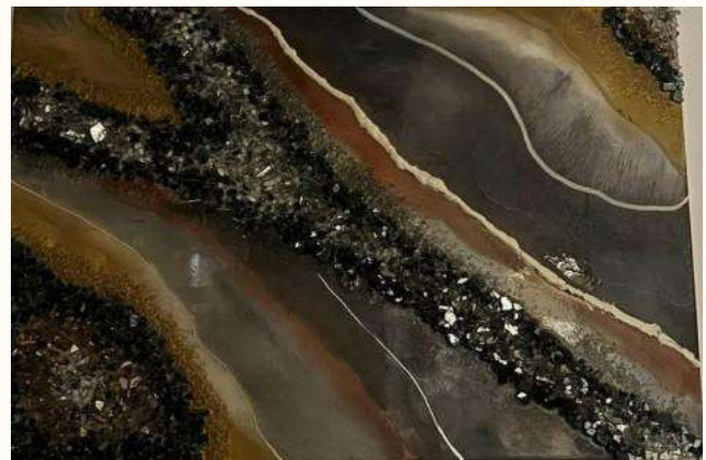
Title: Vitrum Opus: